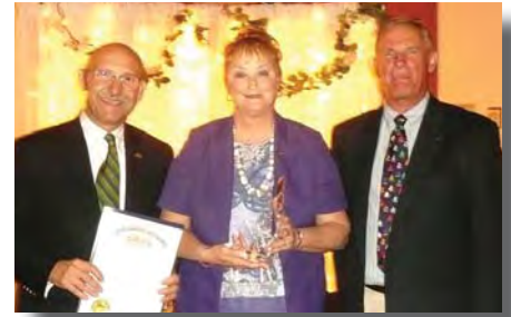
△ Non-Profit of the Year, Big Brothers, Big Sisters of Licking County