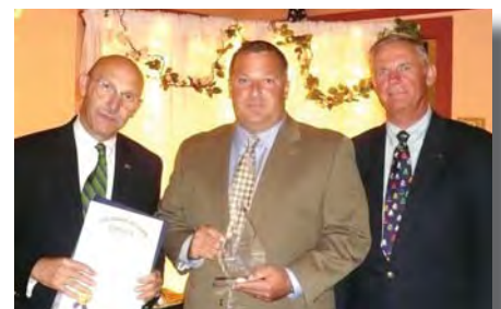
△ Mid-Size Business of the Year, Robertson Construction