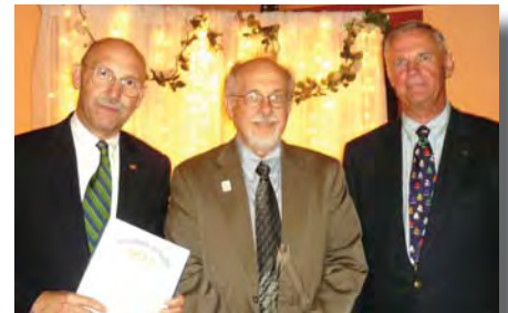
△ Small Business of the Year, The Village Network of Newark