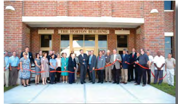
^ The ribbon cutting marked the official opening of Goodrich into the new Horton Building

Today, over 27,000 s.f. of office and clean room space remain available, including and up to 19,000 s.f. of Class A office space adjacent to the high-tech capabilities of adjacent defense contractors Boeing and Bionetics.