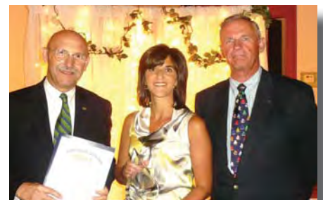
△ Large Business of the Year, Velvet Ice Cream Company