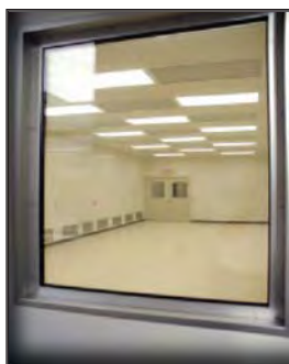
^ Inside the Clean Room

On April 29, 2010, while out for bids but before construction began, Goodrich agreed to lease the first floor as part of a strategy to retain and grow their engineering services operation on the Aerospace Center campus in Heath. Goodrich is a Fortune 500 aerospace company with a 141-year history in Ohio.